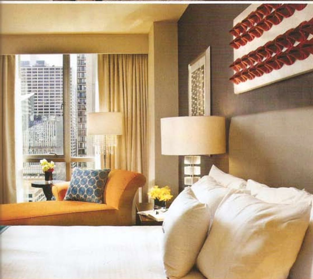
opposite page, from left: A guestroom boasts impressive city views; the Whisper Lounge in the spa, which Rowley calls "an urban lake that's energetic and reflective of the city." Above, from top: A piece of artwork meant to echo the geometry of the local city architecture hangs above the bed in a Cityview Spa Junior Suite; orange and blue hues pop against a natural color palette in a typical guestroom.